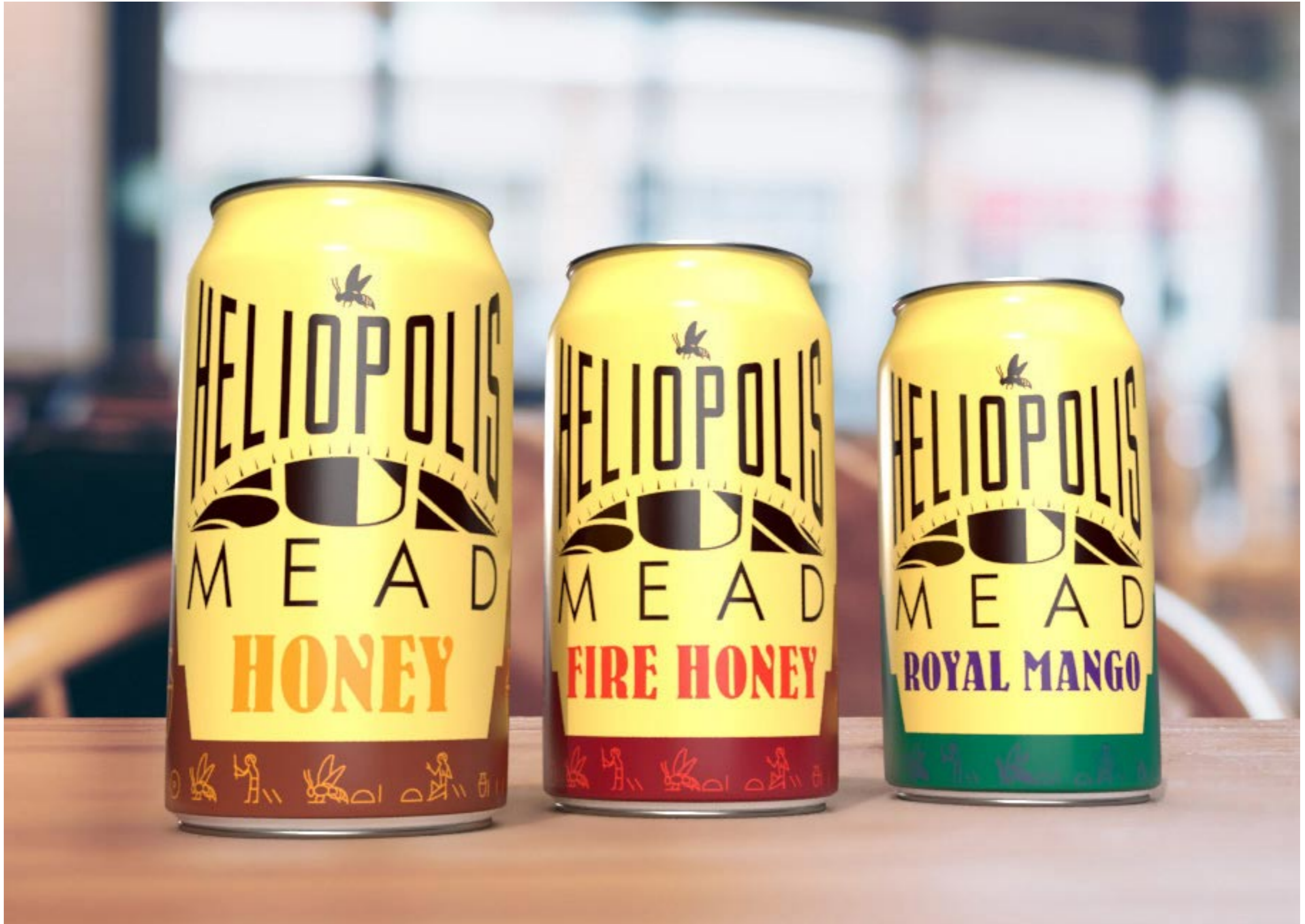
Heliopolis Sun: Mead Beverage Can Design Mockups